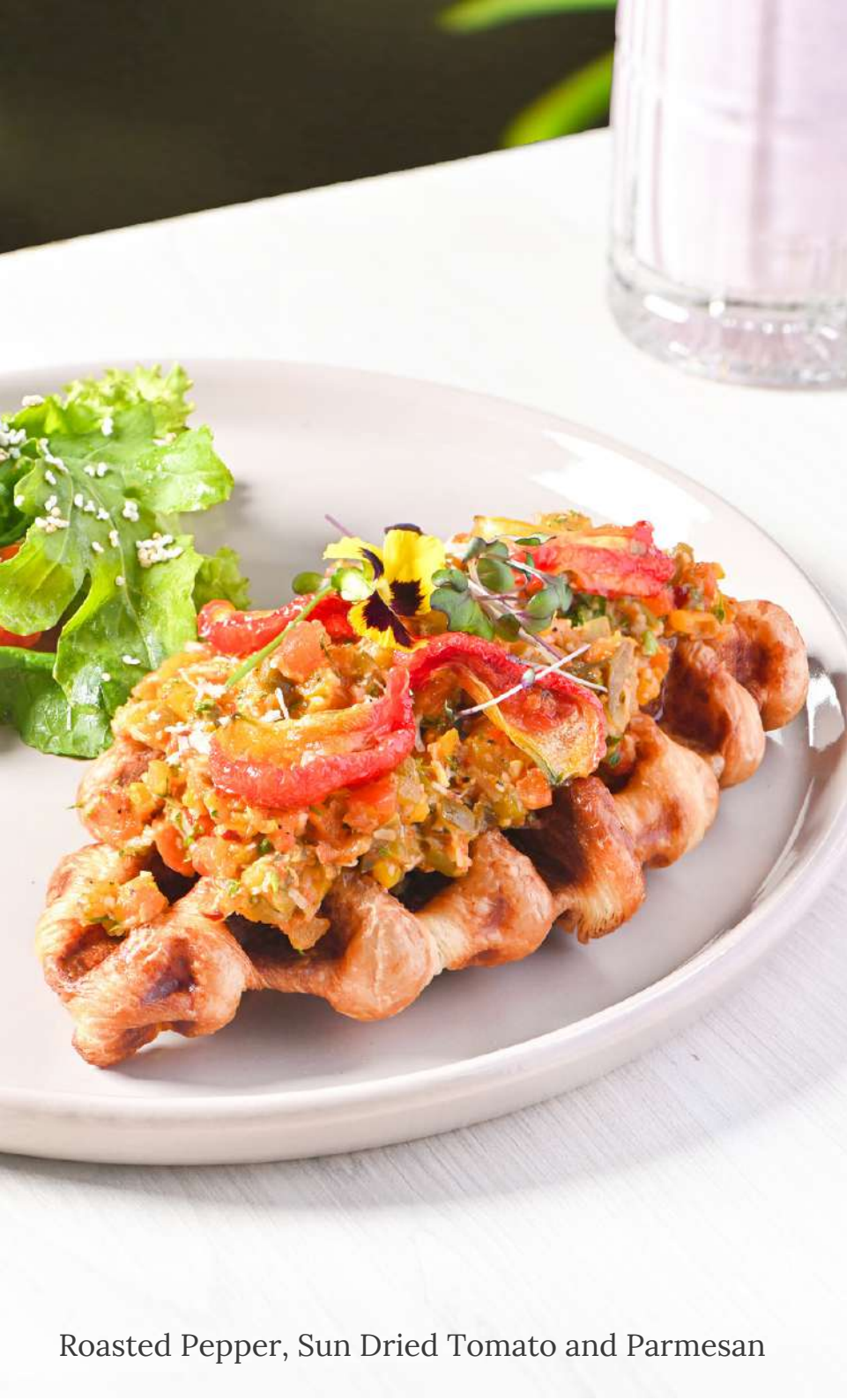
Roasted Pepper, Sun Dried Tomato and Parmesan