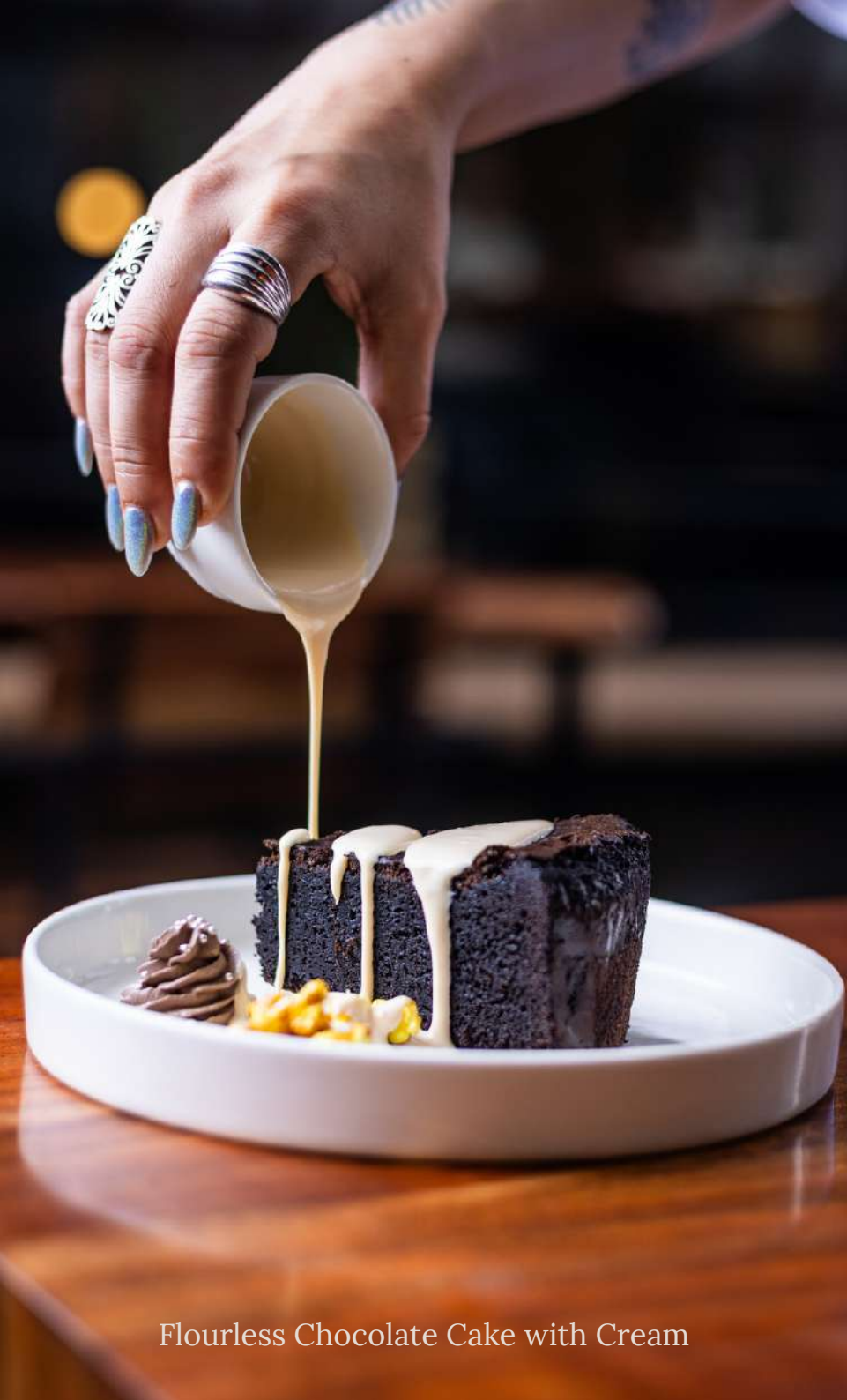
Flourless Chocolate Cake with Cream