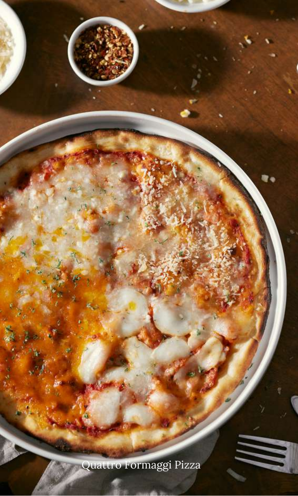
Quattro Formaggi Pizza