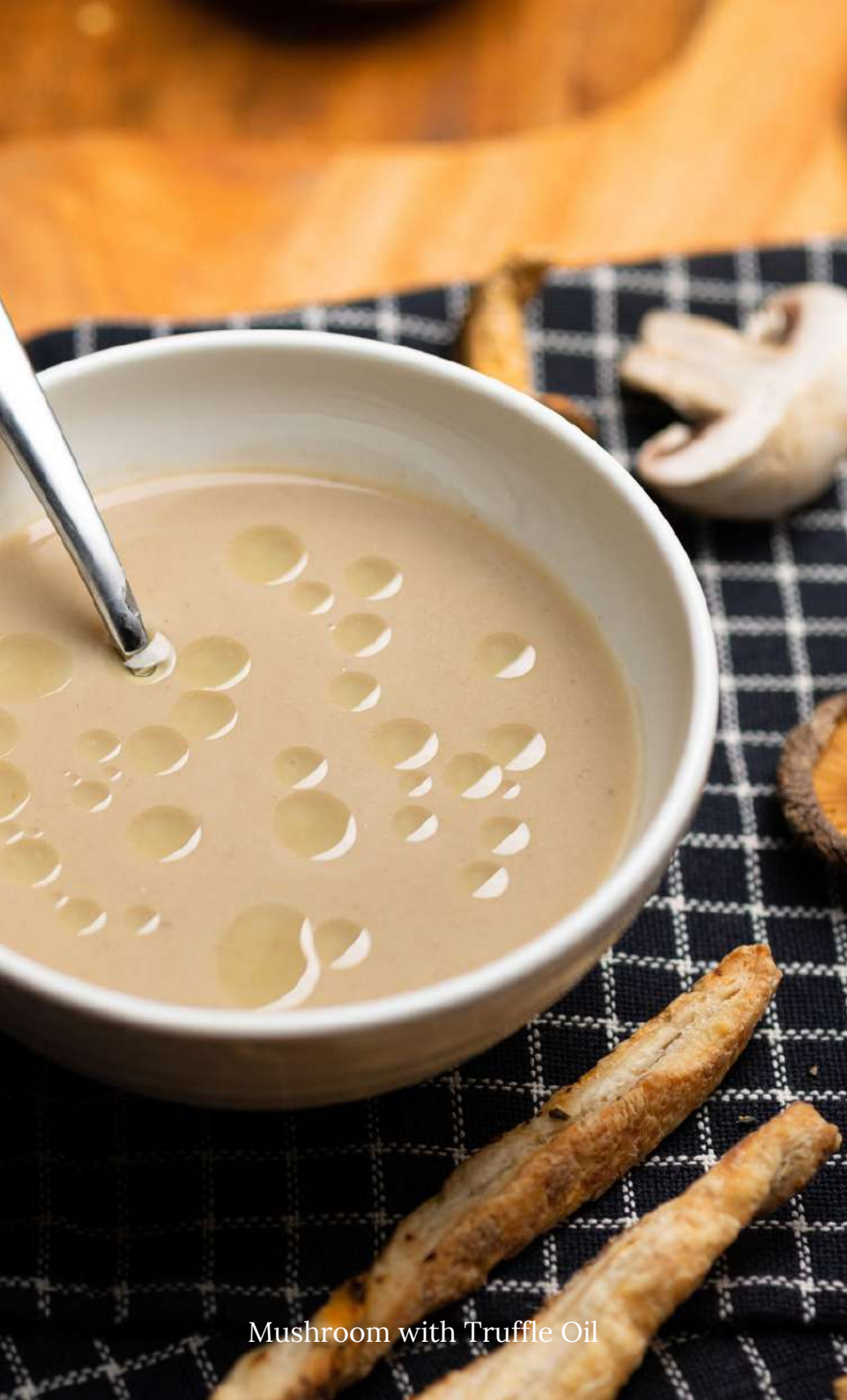
Mushroom with Truffle Oil