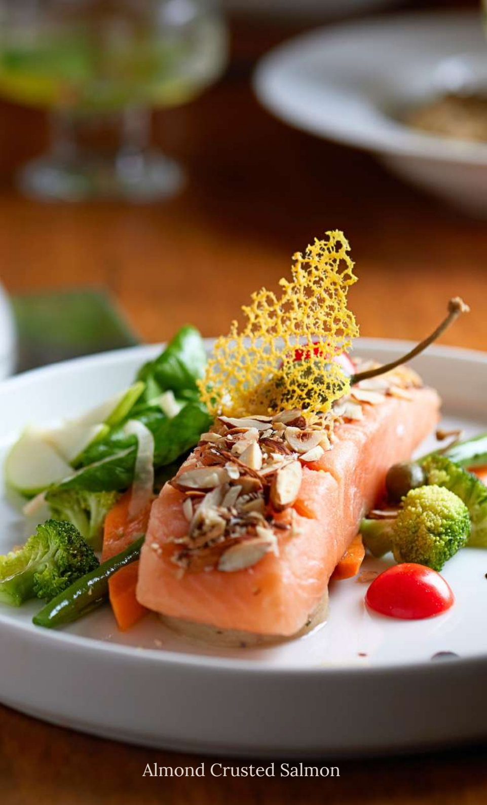
Almond Crusted Salmon