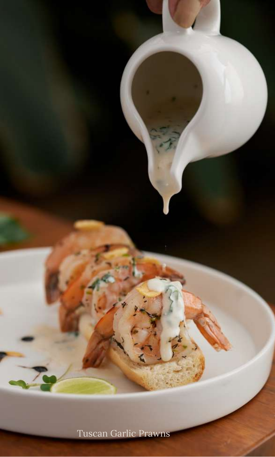
Tuscan Garlic Prawns