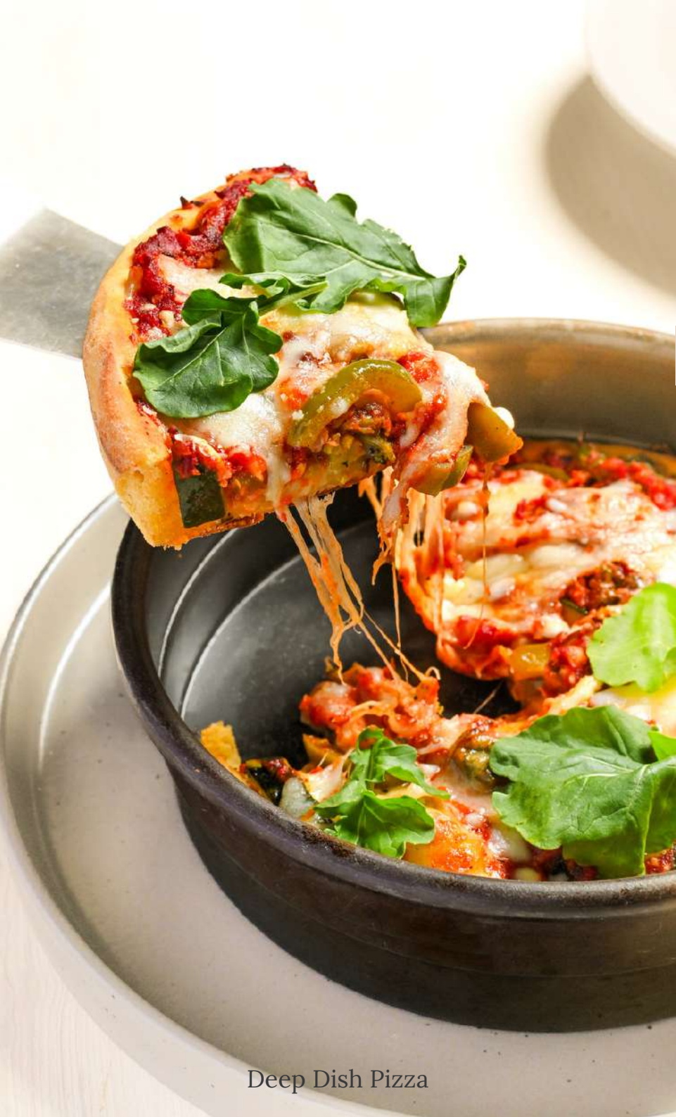
Deep Dish Pizza