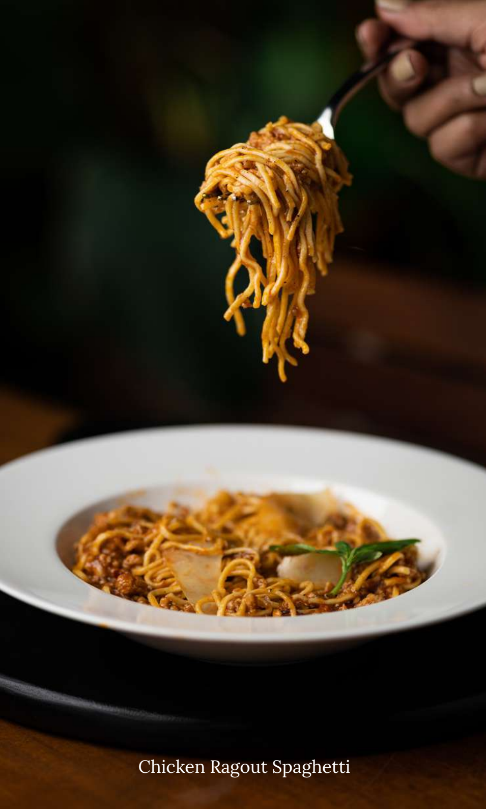
Chicken Ragout Spaghetti